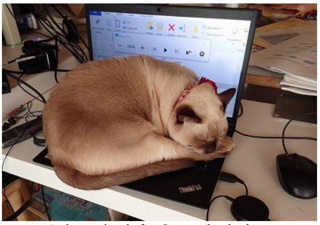
And sometime before I get to the shack..... Waiting for the bands to open.....