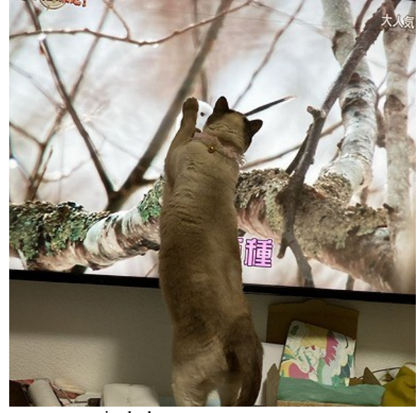
particularly nature programmes......