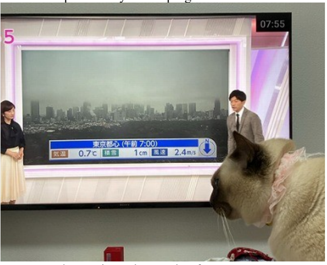
and sometimes the weather forecast too.....