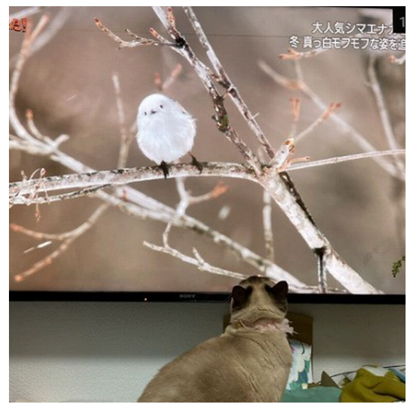
PUSS is also an avid TV watcher