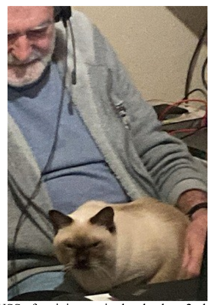
PUSS often joins me in the shack as 2nd op.