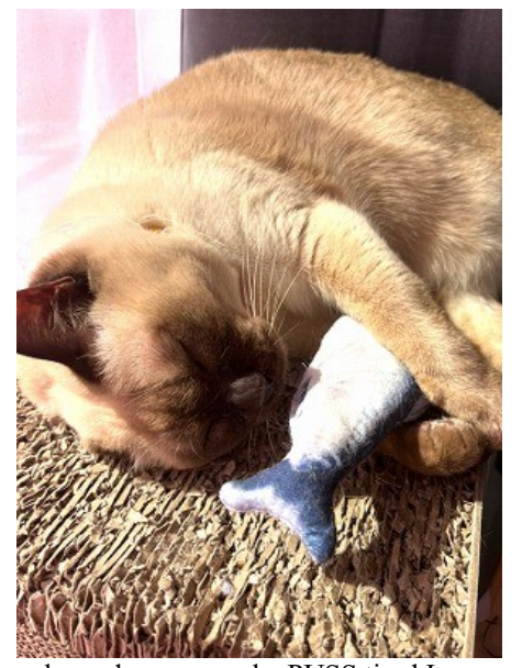
These busy days can make PUSS tired I guess.....