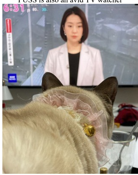
PUSS also likes to watch the news